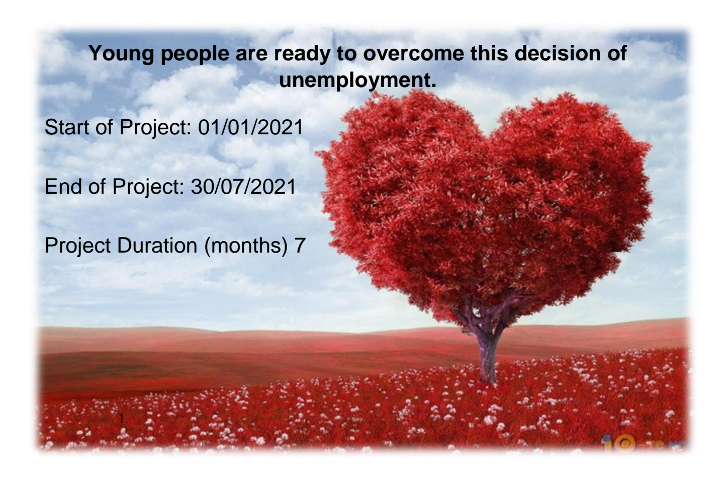
Bulgaria - 25 participants